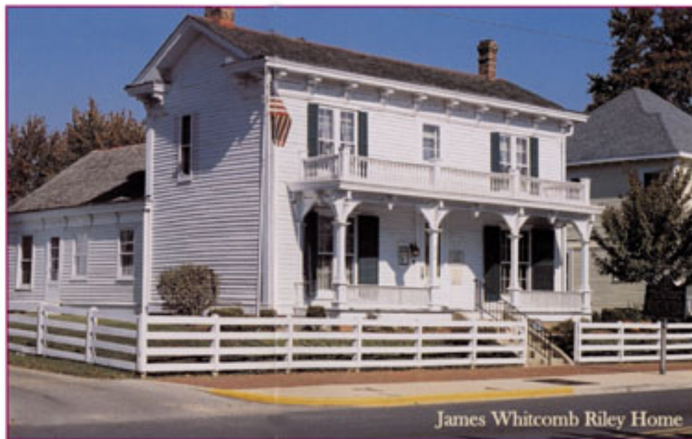
James Whitcomb Riley Home

Whether you spend just a few hours or several days touring our museums, you'll be surprised how much there is to see and learn about our heritage and the development of Central Indiana right here in Hancock County – the Heart of the Crossroads.