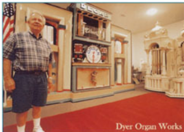
Dyer Organ Works

Hancock County Visitors Bureau