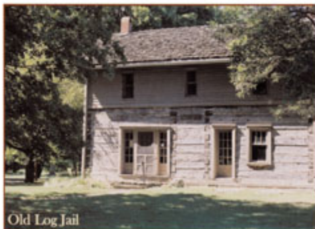
Old Log Jail